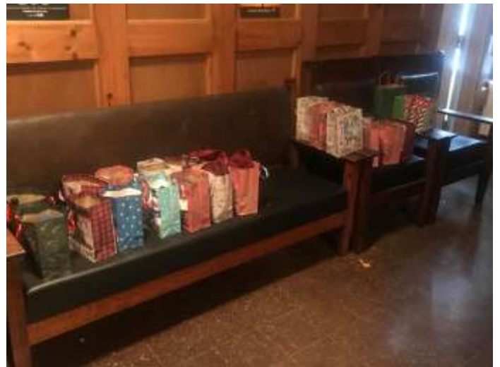
25 Bagged Christmas presents for local nursing home residents