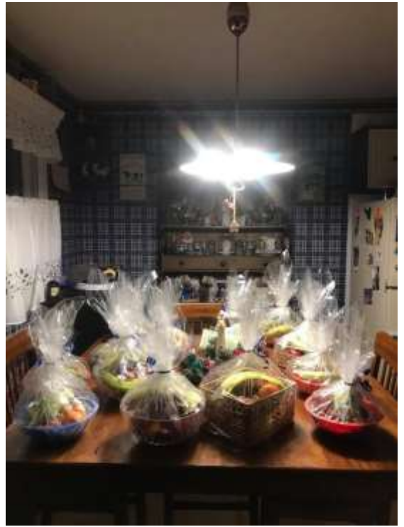
Fruit baskets ready for delivery to shut ins