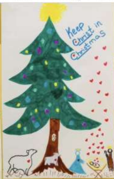
1st Place - 3rd-5th grade