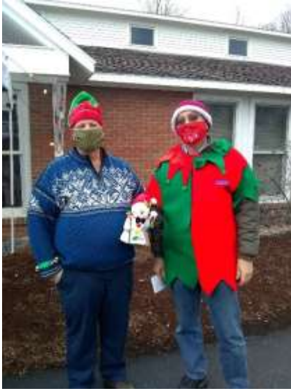
Christmas drive thru with Santa Claus & his helpers