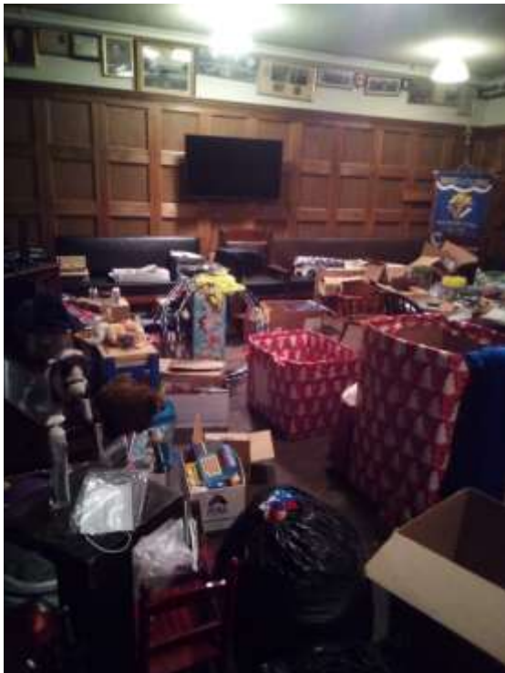
Council Hall full of toys for distribution