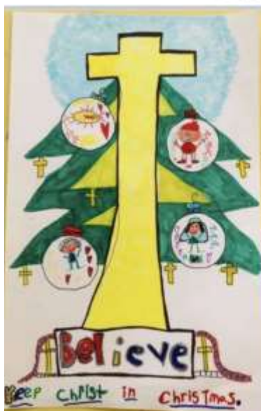
1st Place: K-2nd grade