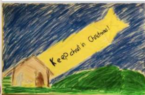
1st Place - 6th-8 grade